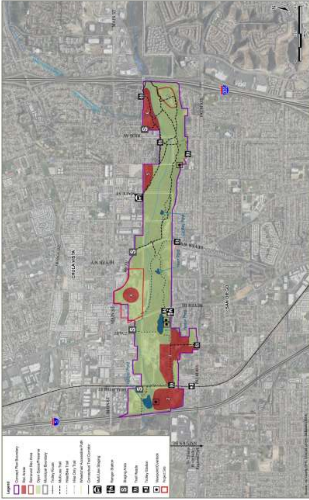
Figure 5. Otay Valley Regional Park