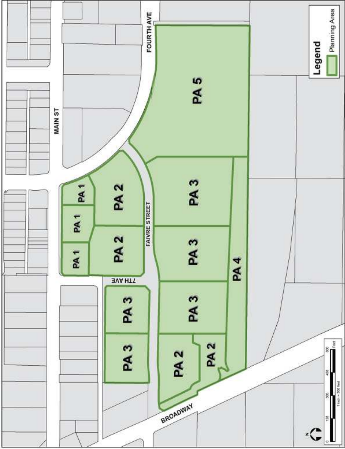
Figure 1. Land Use Map