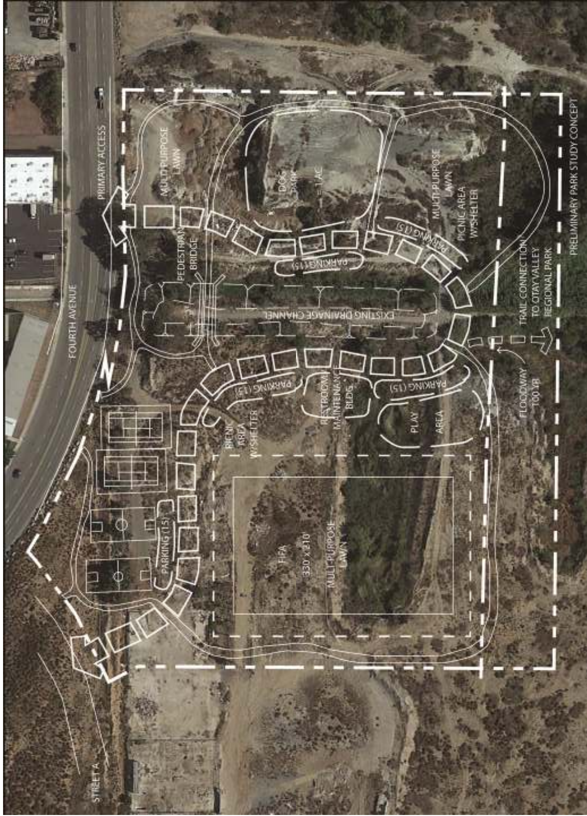
Figure 3. Preliminary Park Graphic