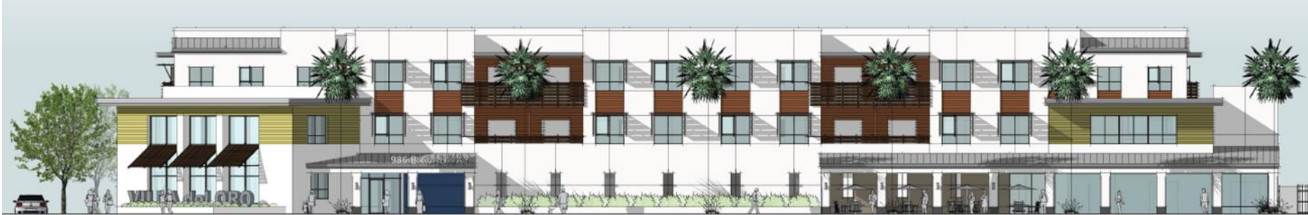
Front View from Broadway