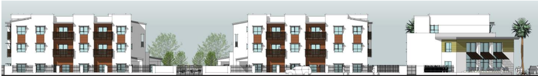
Side View from Moss Street