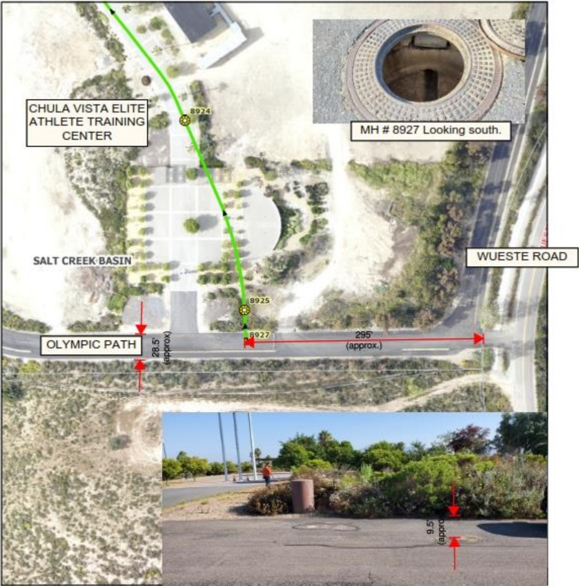
EXHIBIT B – PLAT