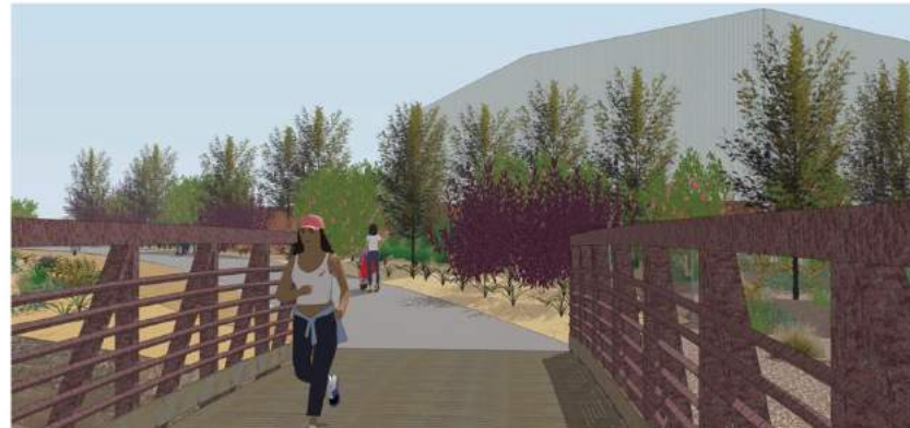
BOAT WORKS EAST EDGE FROM PEDESTRIAN / BIKE BRIDGE