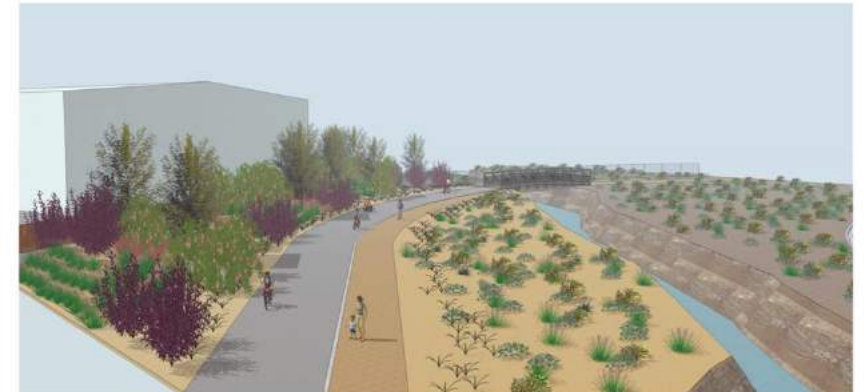
AERIAL VIEW OF BOAT WORKS EAST EDGE LOOKING NORTH