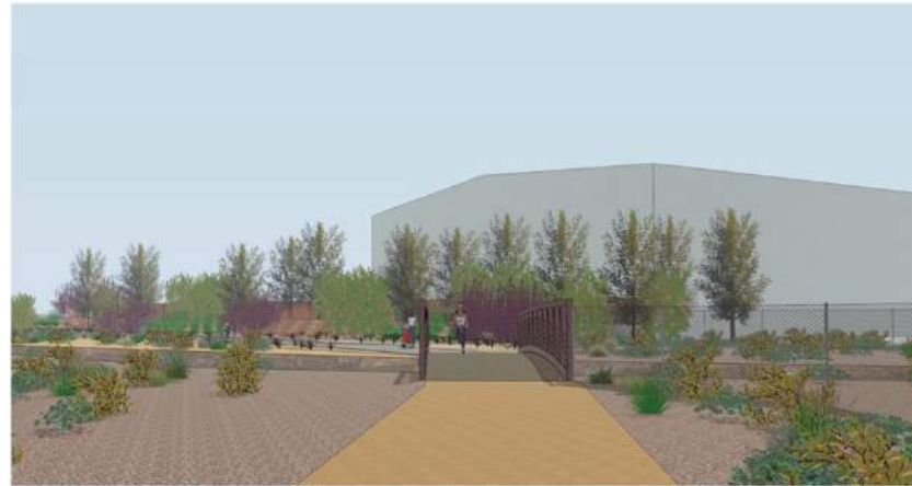
PEDESTRIAN / BIKE BRIDGE AND NORTHEAST BOAT WORKS BUILDING