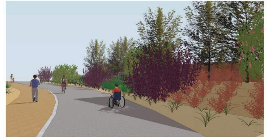
BOAT WORKS EAST EDGE PROMENADE AND LANDFORM