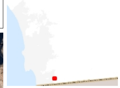
Exhibit B Otay Lakes County Park