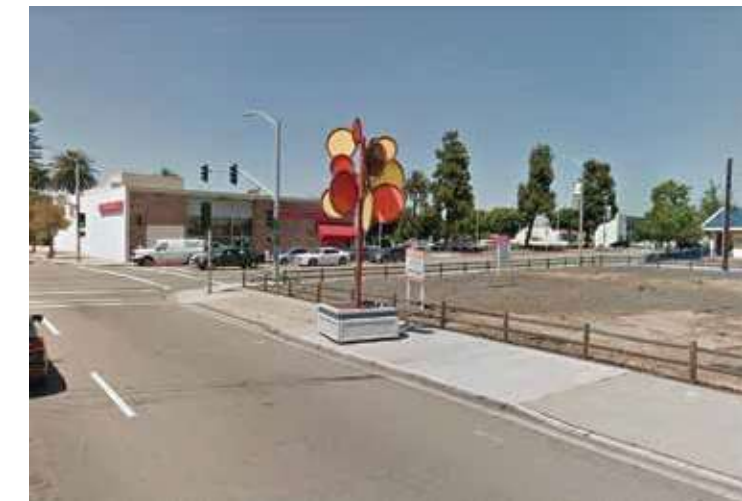
M.2 TREE SCULPTURE #2 - EXISTING LOCATION THIRD AVENUE SOUTH OF "E" ST. CHROMASOL TREE - 16' HIGH