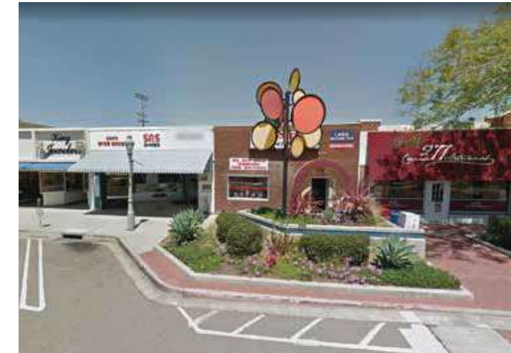
M.1 TREE SCULPTURE #1 - EXISTING LOCATION THIRD AVENUE NORTH OF "F" ST. CHROMATASOL TREE - 15' HIGH

4: \PROJECTS\STL0406 - THIRD AVE PH III\CAD\EXHIBITS\STL-406_TREE SCULPTURE LOCS.DWG 4/16/2019 8:42 AM TREE SCULPTURES: EXISTING TREE LOCATIONS AND RELOCATION SITE