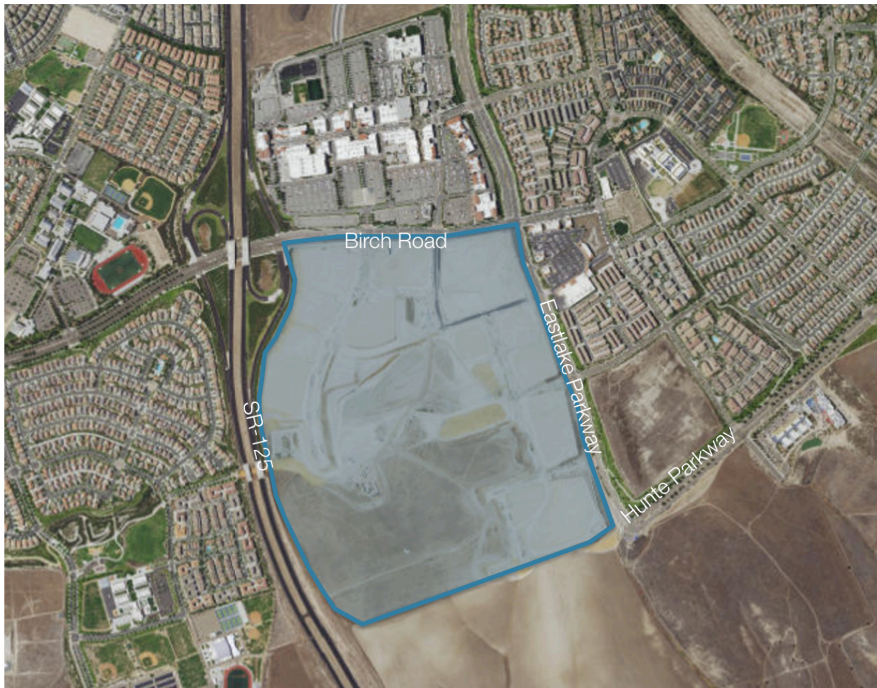
Figure 4 - Site Map