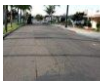
PCI = 68