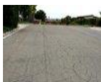
PCI = 40