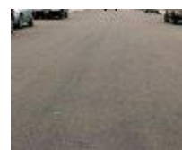
PCI = 95