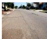
PCI = 75