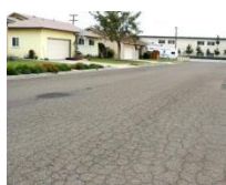
PCI = 21