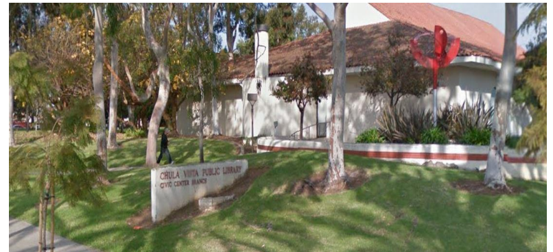
Civic Center & South Libraries Repairs - $1.5m