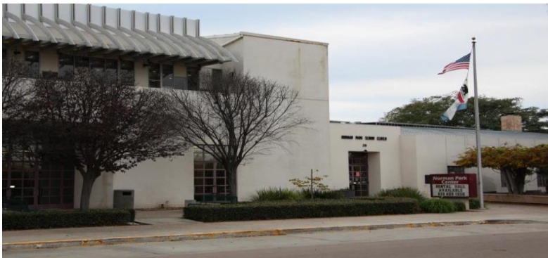
Senior & Rec Centers Repairs - $2 million