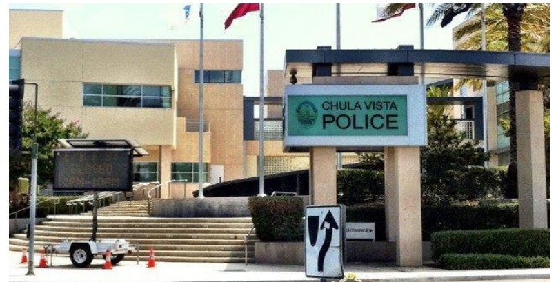
Police Facility - $500,000