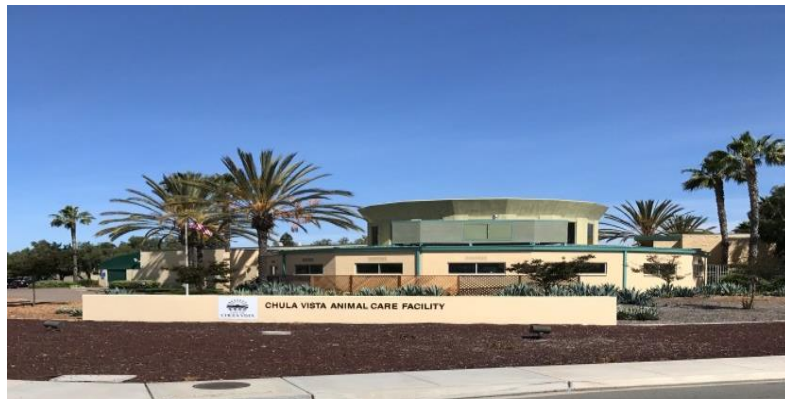
Other Public Building Repairs - $2 million