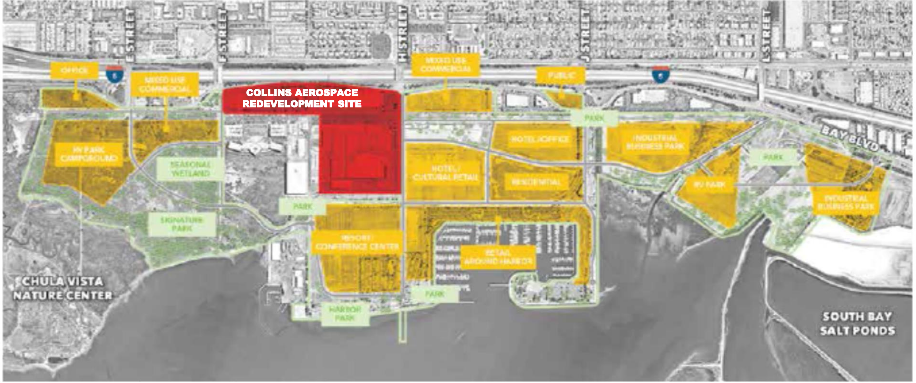
CHULA VISTA BAYFRONT MASTER PLAN