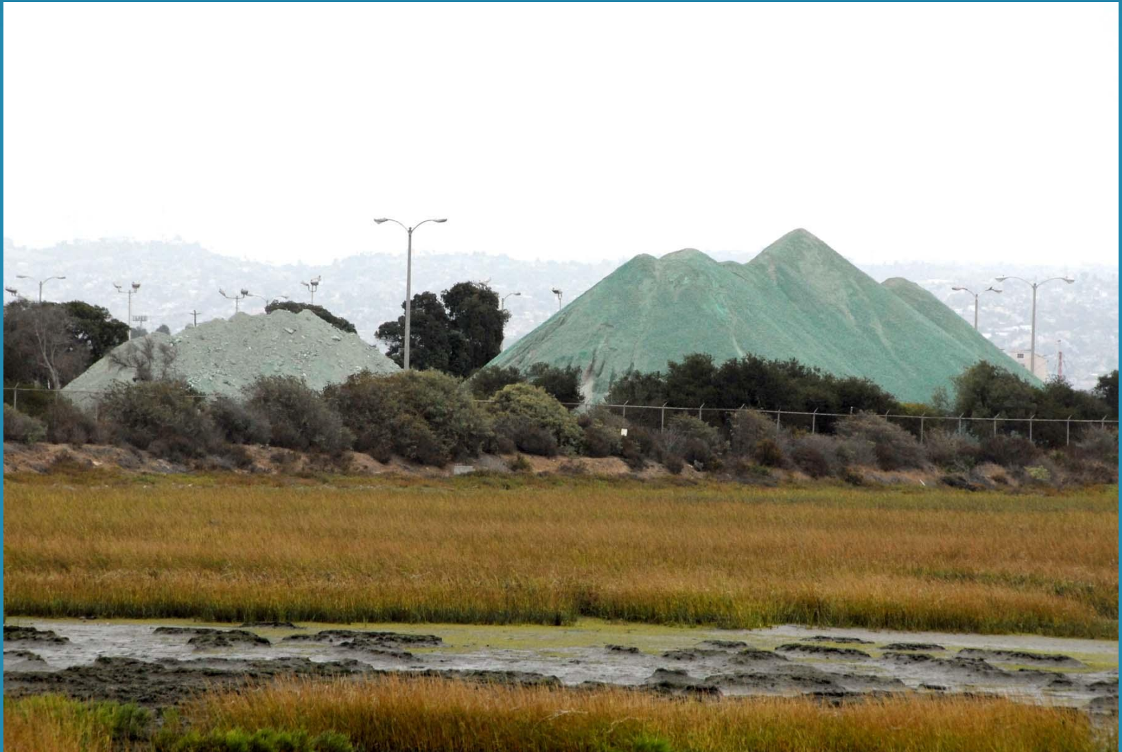
South Bay Power Plant site