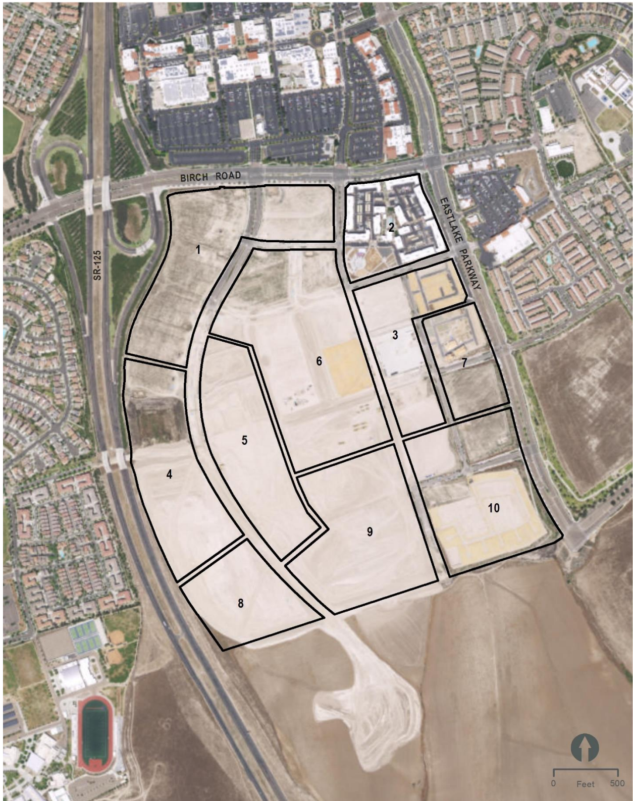
Figure 1. Aerial Photo of Site Conditions (2016)