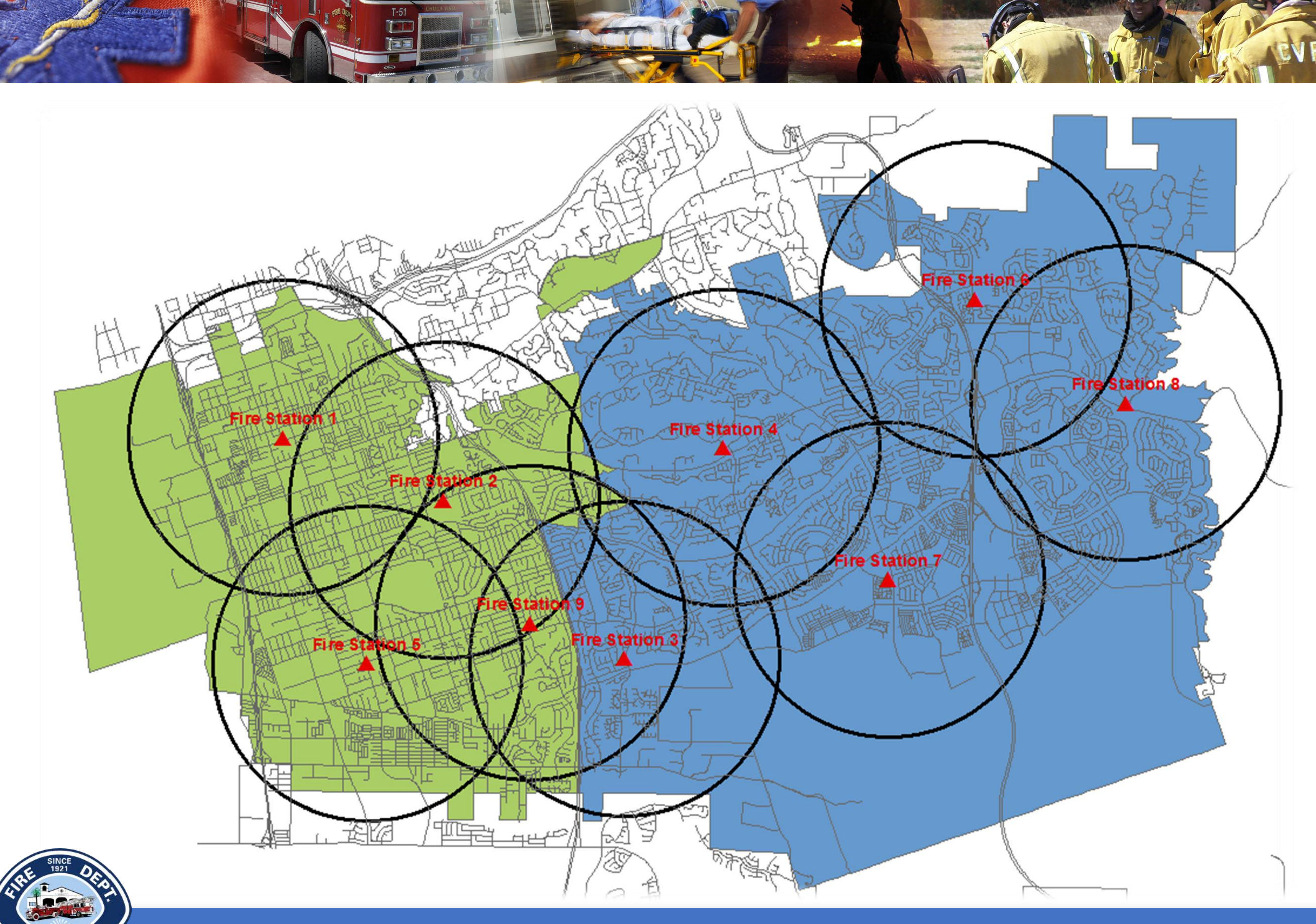
Current 9 fire station delivery network