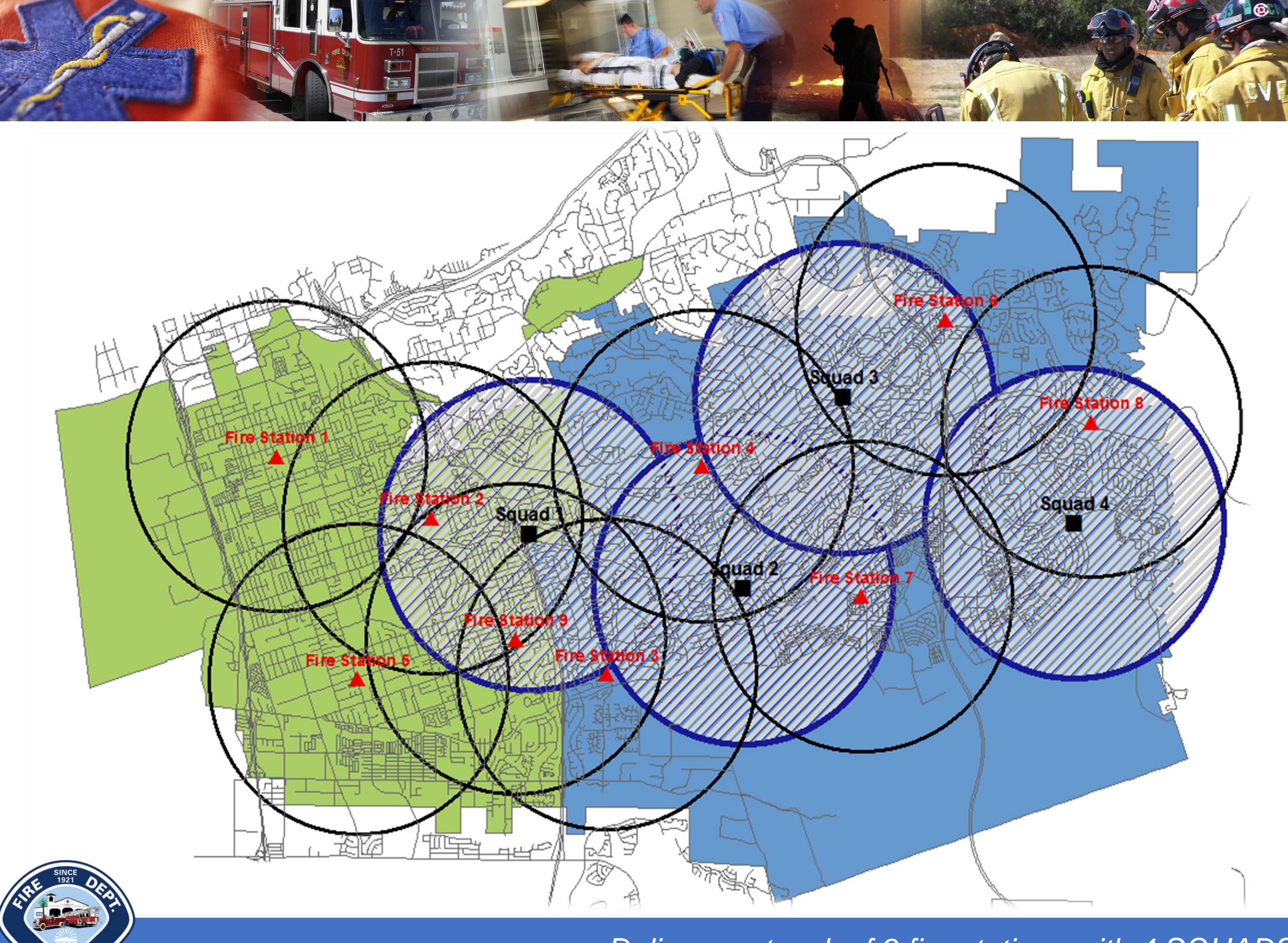
Delivery network of 9 fire stations with 4 SQUADS