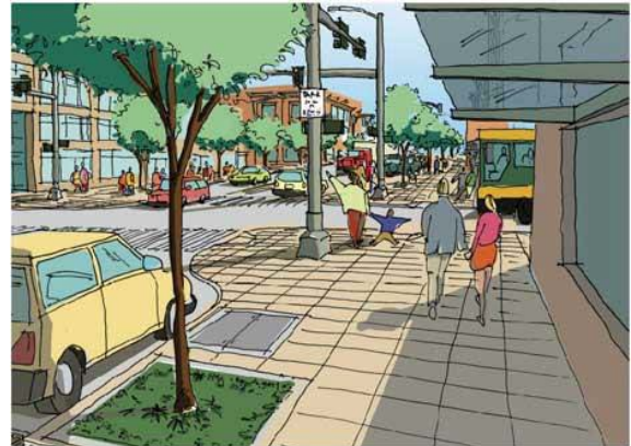
Landscape/Furniture Zone Pedestrian Zone Frontage Zone