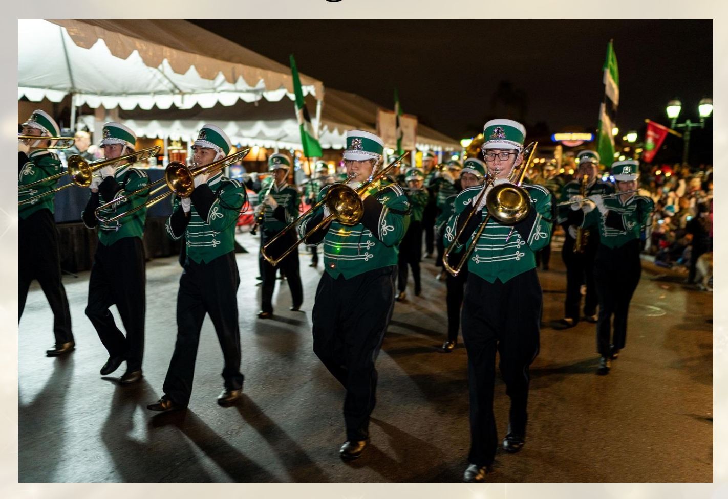
Hilltop Lancer Band