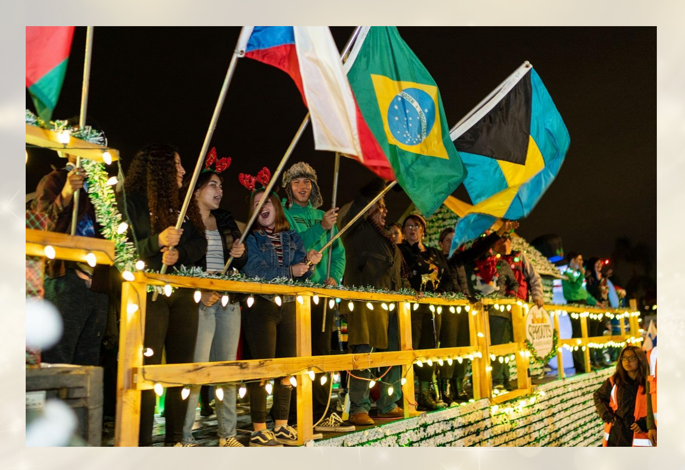
Hilltop High School and Sprouts