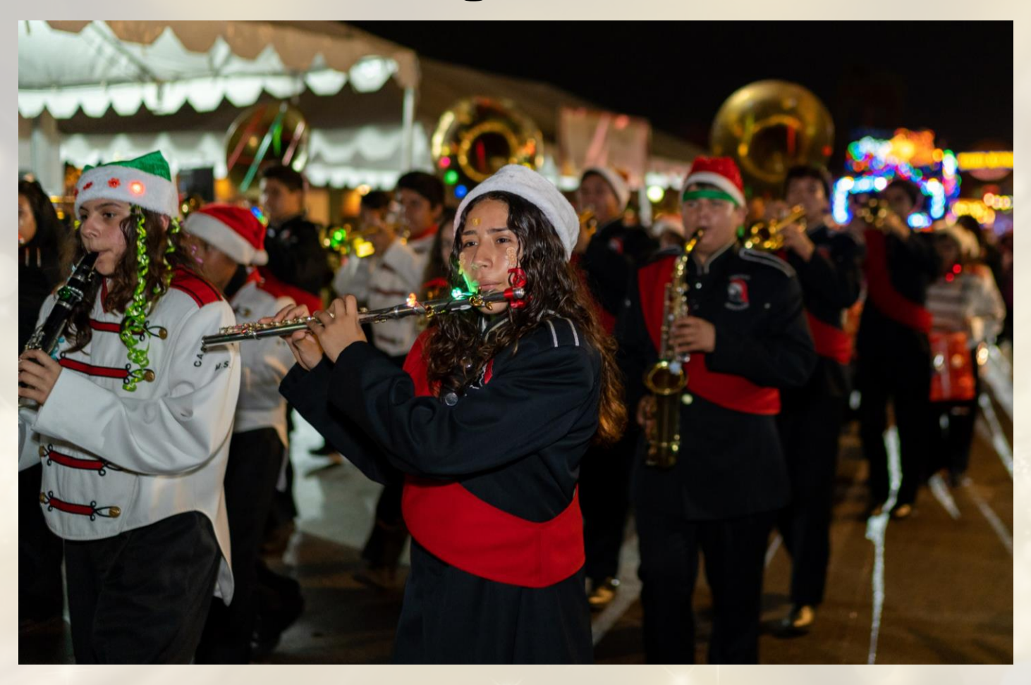
Castle Park Marching Band