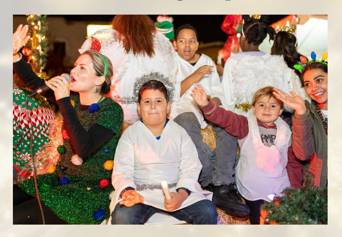
New Covenant Tabernacle Church