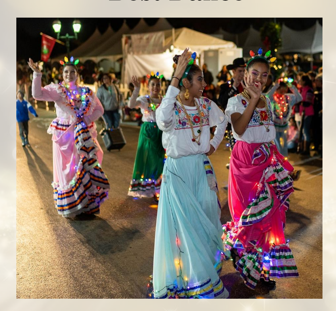
Ballet Folklórico La Fiesta Del Pueblo