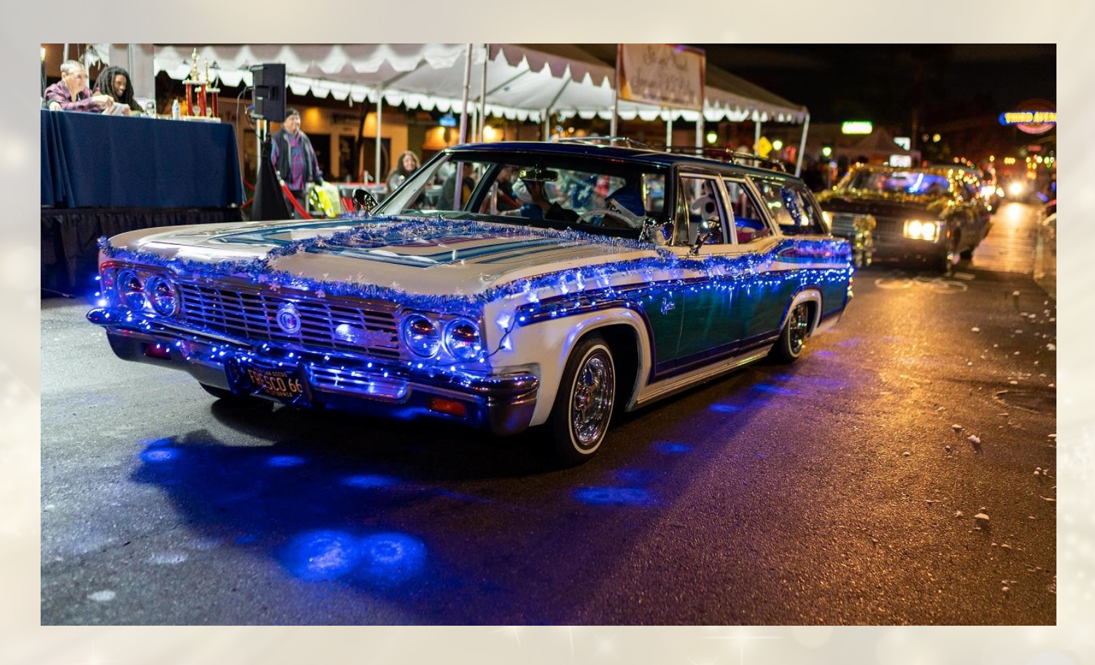
Raza Car Club