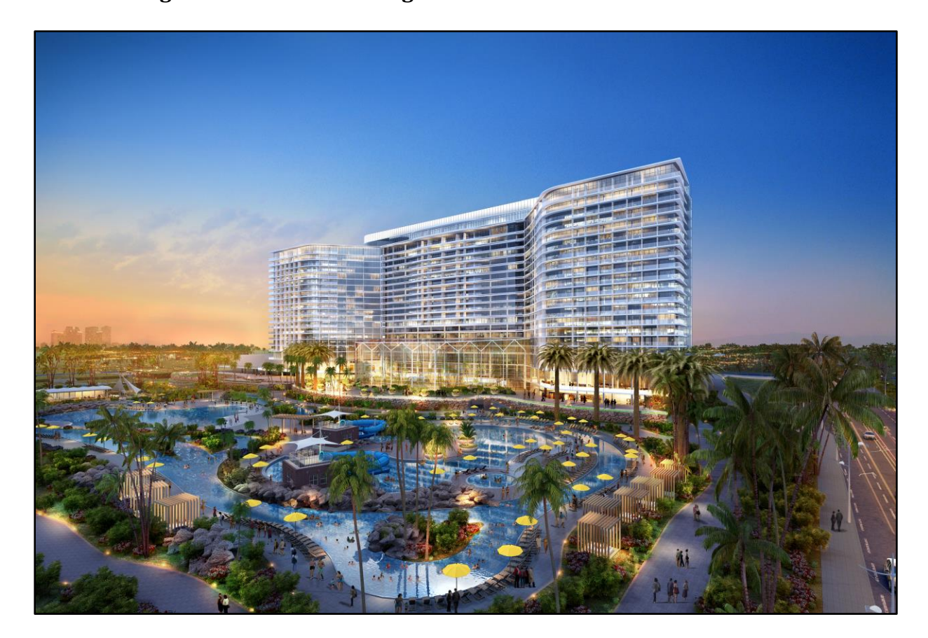
Figure 3: Visual Rendering of the Resort and Convention Center

Phase I implementation of the Chula Vista Bayfront Master Plan includes construction of the resort and convention center, as well as the creation of public parks and open space, the restoration of habitat areas and the construction of a new fire station, a new 1,600 stall parking structure and mixed-used development.