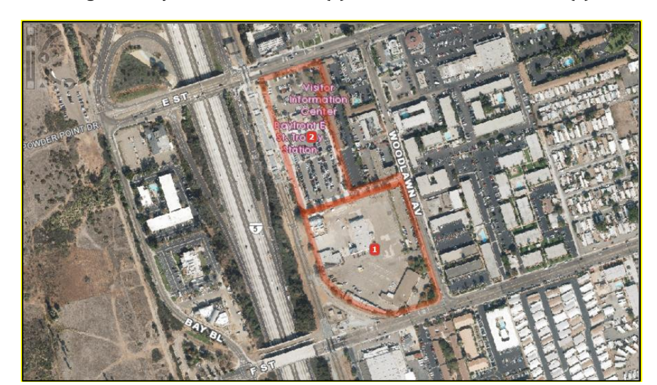
Figure 6: City-owned 707 F Street (1) and MTS-owned 750 E Street (2)