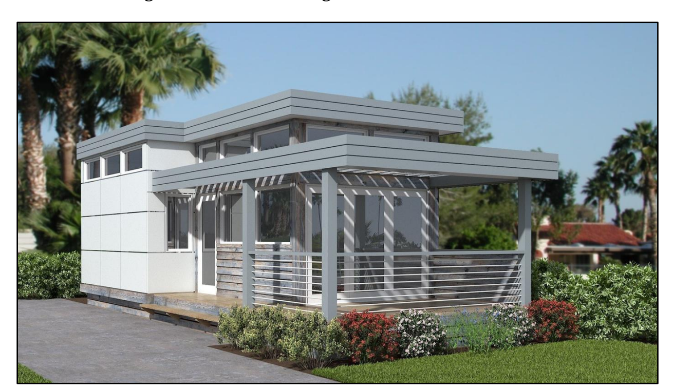
Figure 4: Visual Rendering of the Costa Vista RV Resort

Additional amenities include aquatic features including a children's play pool, family pool and Jacuzzi; day spa/salon, massage treatment rooms, sauna and work-out gym; grill/restaurant; entertainment arcade, game room; business center and a multi-purpose room for educational and large guest gathering. A covered picnic area with outdoor grills; children's rock climbing and playground, bocce ball courts and horseshoe pits; protected dog area; and welcome center with a marketplace, restrooms, showers and guest laundry facilities.