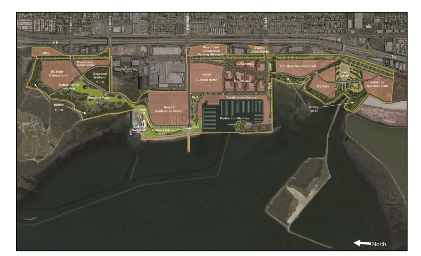
Figure 1: Chula Vista Bayfront Master Plan (Site Plan)

Approximately 230 acres (more than 40%) of the project's total acreage is dedicated to parks, open space and habitat restoration/preservation; with 130 acres identified for new parks and open space. These areas will include promenades, bike and hiking trails and other public access areas linking the entire Bayfront. See Figure 2 for a photograph of the Chula Vista Bayfront looking northwest toward downtown San Diego.