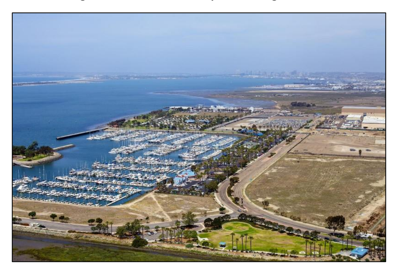
Figure 2: View of Chula Vista Bayfront Looking Northwest

Once completed, the public will enjoy more than 200 acres of parks, a shoreline promenade, walking trails, RV camping, shopping, dining and more. Preliminary site preparation is already underway with the construction of access roads, new public streets and other infrastructure to be underway in 2019. Construction of the resort and convention center is expected to be complete by 2023.