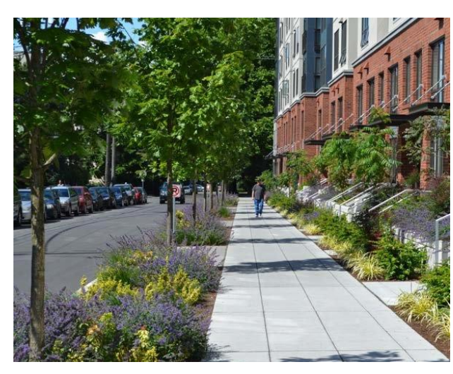
Furnishings and Landscaping