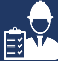
Mandatory Organics Disposal Reduction Ordinance